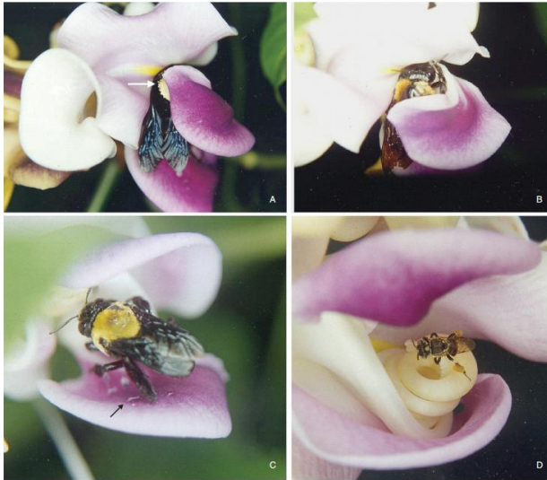
Figure 2 Floral visitors of V. caracalla (Adopted from Etcheverry et al., 2008)

evidenced by the higher success rates of hand-crossed fruits compared to hand-selfed ones in V. caracalla (Figure 2) (Etcheverry et al., 2008). The long-term conservatism of floral traits in the Dipterygeae clade has also ensured the maintenance of these specialized interactions over millions of years (Carvalho et al., 2023a).