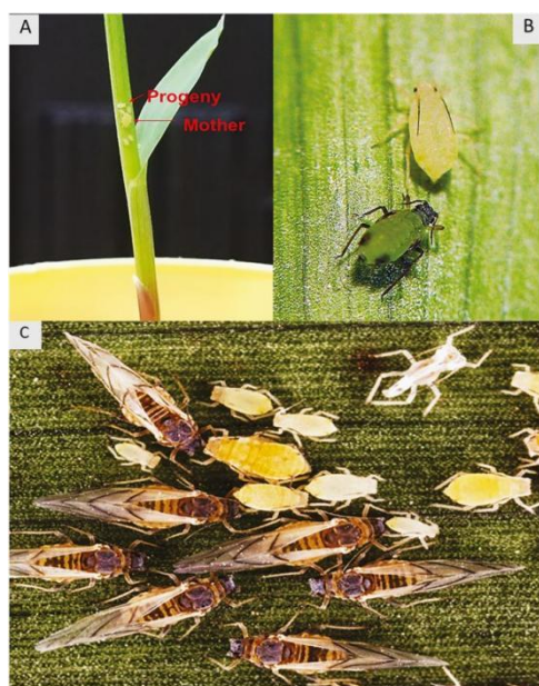
Figure 2 (A) Small colony of aphids on sorghum, (B) Corn leaf aphid and sugarcane aphids on sorghum, (C) Adult sugarcane aphid adults in winged and wingless forms (Adopted from Okosun et al., 2021)

Sorghum is susceptible to a wide range of pests and diseases that can significantly impact its yield and quality. Key insect pests include the sorghum shoot fly ( Atherigona soccata ), stem borers (such as Chilo partellus and Busseola fusca ), armyworms ( Mythimna separata and Spodoptera spp. ), aphids ( Melanaphis sacchari ), and head caterpillars ( Helicoverpa armigera ) (Figure 2) (Okosun et al., 2021). These pests attack various parts of the plant, from the roots to the grain, and can cause substantial damage if not managed effectively. Diseases affecting sorghum include fungal infections, such as anthracnose and grain mold, which thrive in humid conditions and can lead to significant crop losses.